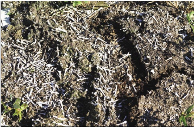
These cane rat bones came from a single barn owl box placed in a sugar cane field.

ing says that an owl family living in one box can patrol up to 20 acres of vineyards. On larger, more sophisticated properties, additional boxes can be added to increase the density. In terms of scale, Browning says that a single barn owl family can eat up to 3,000 rodents in one year.